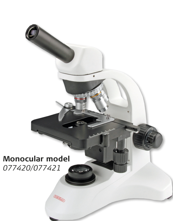
Monocular model 077420/077421