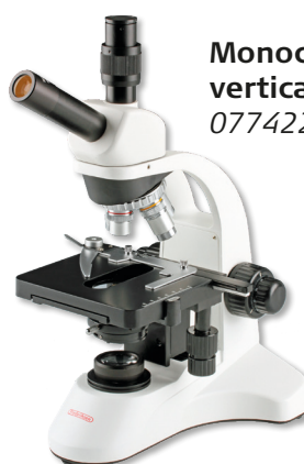
Monocular with vertical tube 077422